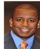
Former Congressman Kendrick Meek Former Captain Florida State Highway Patrol