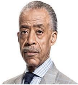
Rev. Al Sharpton National Action Network President & Founder